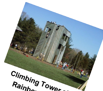
Climbing Tower at Rainbow Scout Reservation