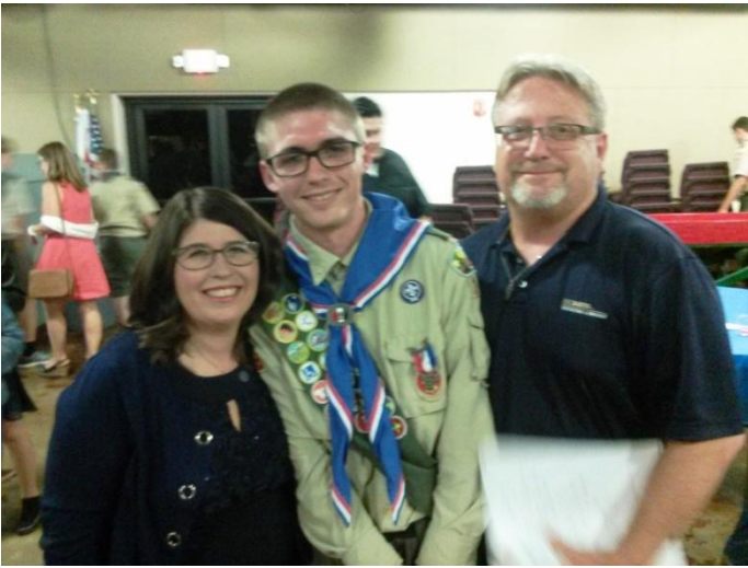
Eagle with proud parents.